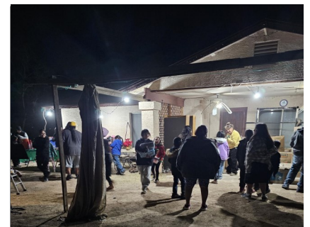
Christmas shoe boxes being handed out in Arizona.